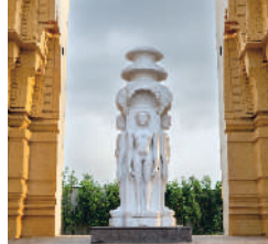
Plaza of Equanimity Temple installation with Sarvatobhadra statue