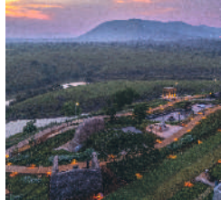
Heritage Walk- Nature Trail Miniatures of Jain monuments