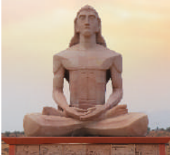
Rishabhdev Fountainhead of Civilizational Values