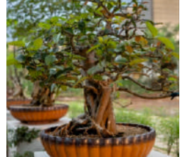
Garden of the Revered Trees dedicated to the 24 Tirthankars